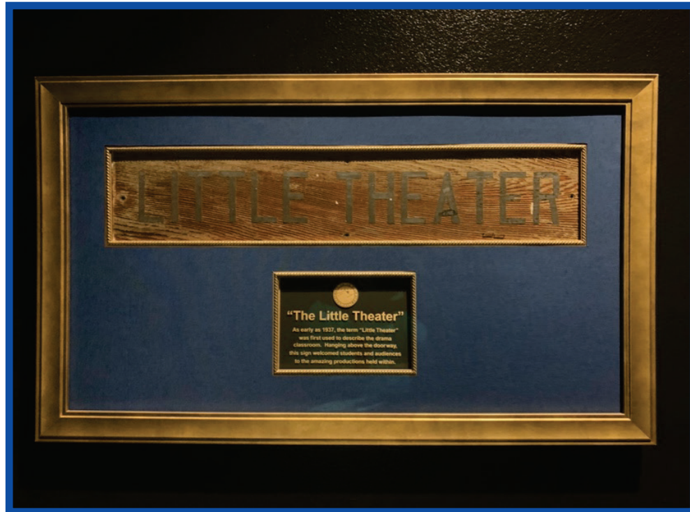
Original Little Theater Sign and Plaque At the Entrance to the Black Box Funded by Pat Mercer Potter, Class of 1948