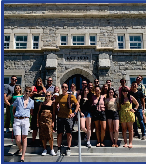
Class of 2013 Tours the Campus