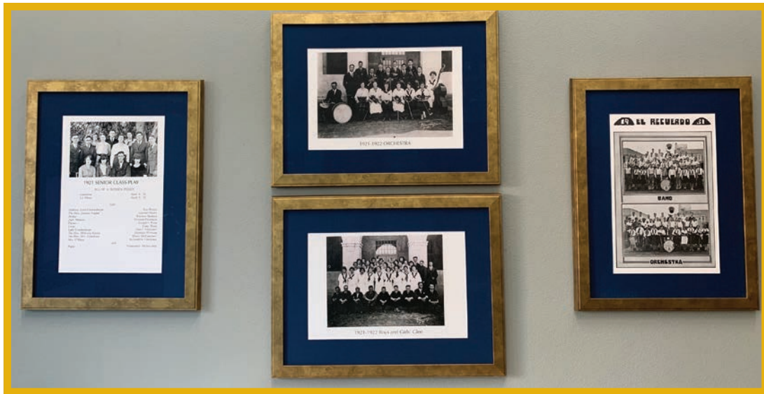
1921 Senior Class Play; 1921-22 Orchestra; 1921-22 Boys and Girls Glee; 1931 Band and Orchestra