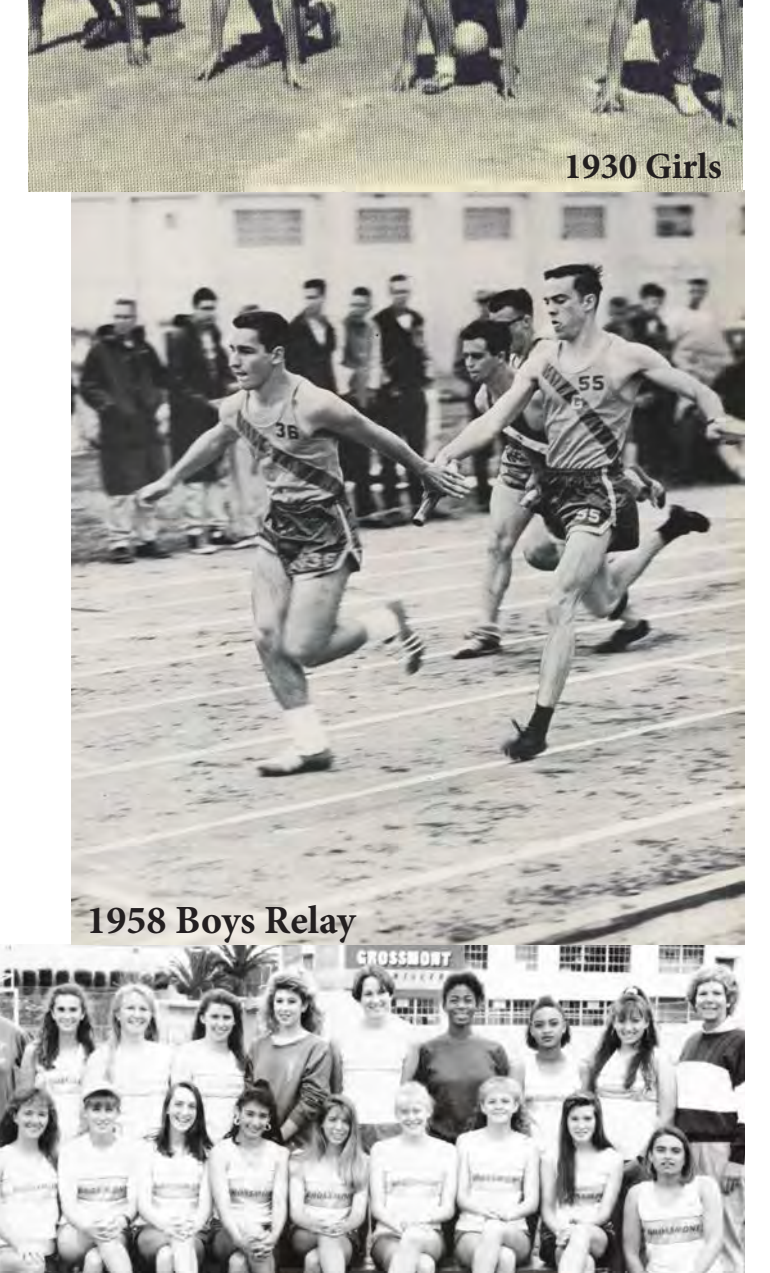
1992 Girls Track Team