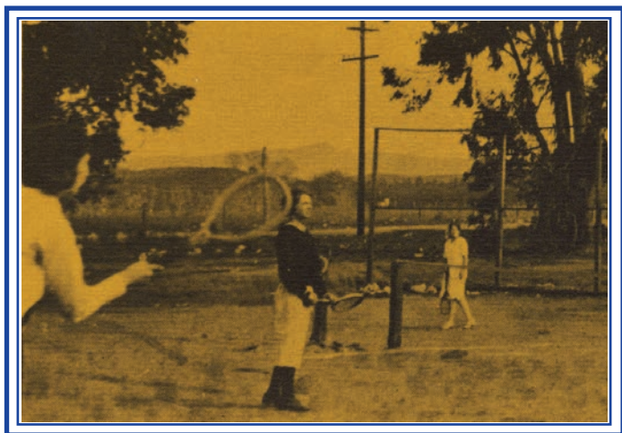
1920's Dirt Tennis Court

May 22, 1925: "Tennis courts (dirt) are finished and ready for use after a year's work"