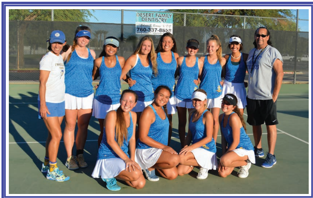
CIF 1st Round Victory over Vincent Memorial 11-7