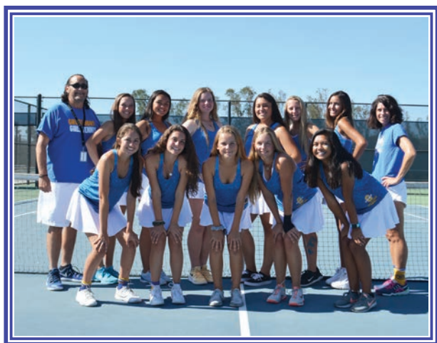
Girls Varsity Team 2018