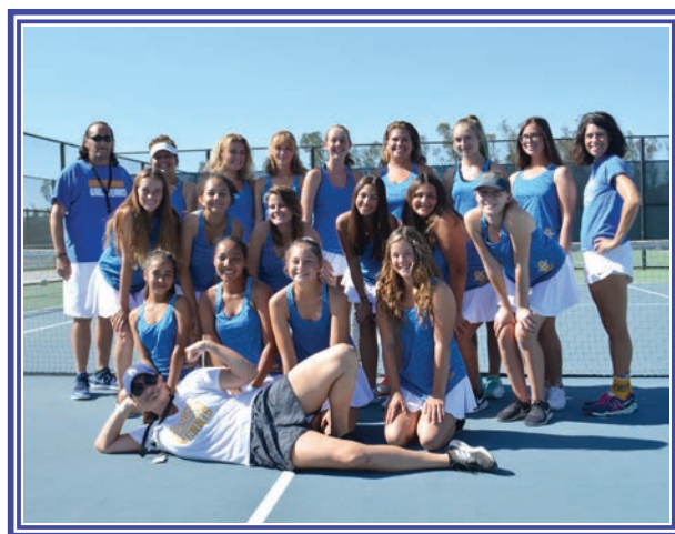
Girls Junior Varsity Team 2018