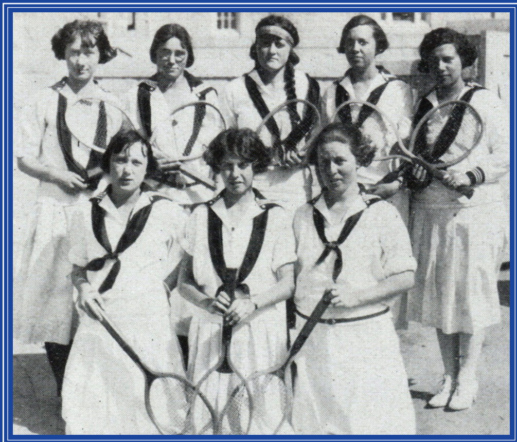
1924 FIRST GIRLS TENNIS TEAM