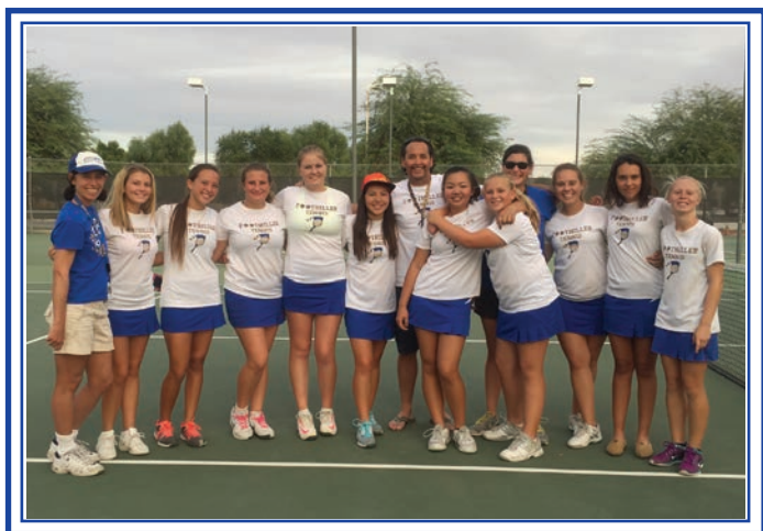
2015 Girls Tennis Varsity Team League Champions